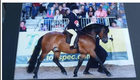
THE SNOW FAMILY

23. No competitor shall behave in an offensive or abusive or unpleasant manner to any show official or judge at any show or via social media or the internet or via any publication in whatever format or via any other written or electronic format, If a competitor is found to be doing so, they will not be allowed to enter any more TEAHS shows for the remainder of the season, if the competitor continues this behavior the ban will continue throughout the following season. TEAHS takes this behavior very seriously.